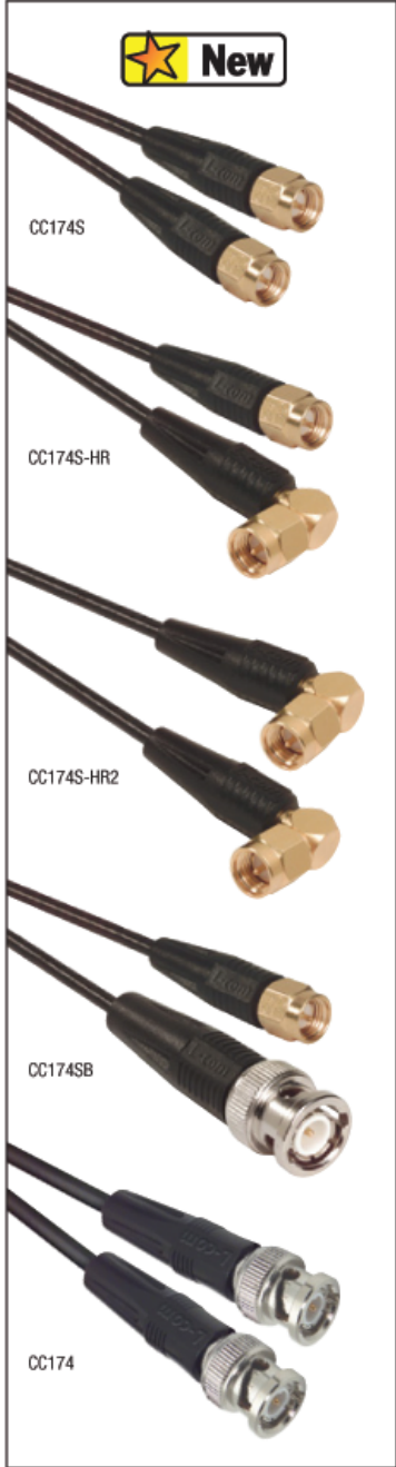
2008 Master Catalog 1.0