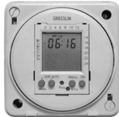
FM1D20E (flush mounting)