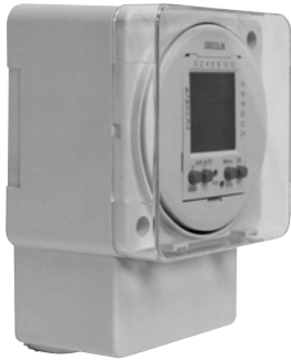
FM1D20A (surface mounting)