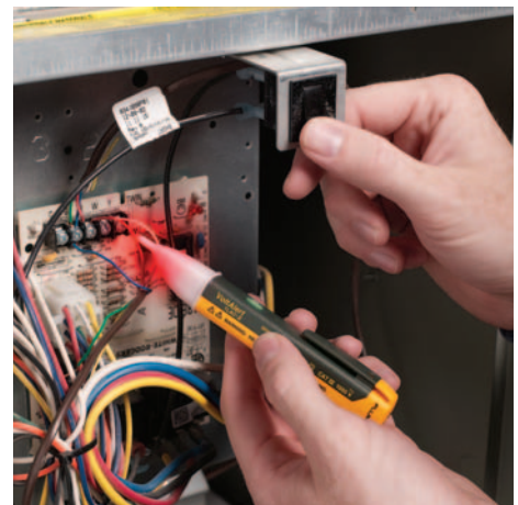
Low volt version

Fluke. Keeping your world up and running.