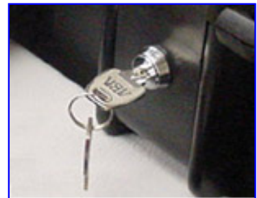
Latches with metal locks