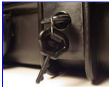
Latches with plastic locks