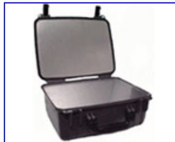
Aluminum Panel Kits