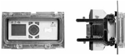
EZ700/500 Panel Window and Mounting Kit