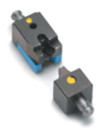
Crimp Dies for Reel 0.14 - 0.5: 11153600 0.5 - 1.5: 11153700 1.5 - 2.5: 11153800

LAPP USA • LAPP CANADA • LAPP MEXICO Headquarters: 29 Hanover Road, Florham Park, NJ 07932 800-774-3539 • FAX: 973-660-9330 • sales@lappusa.com