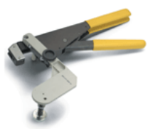
Crimp Tool for Reel 11153500