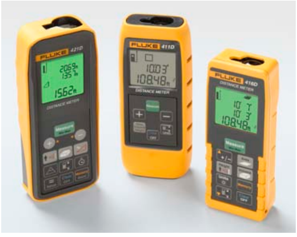
Laser distance meters also display temperature in Metric units (i.e. meters and millimeters)