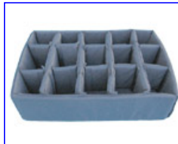
Adjustable Padded Divider