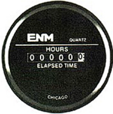
T40 Quartz DC Hour Meter T40 Quartz DC Hour Meter