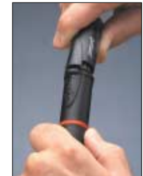
Automatic safety fuel cut-off when cap is replaced.