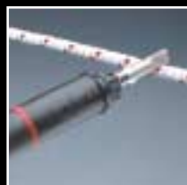
Hot knife tip cuts and seals ends of nylon rope.