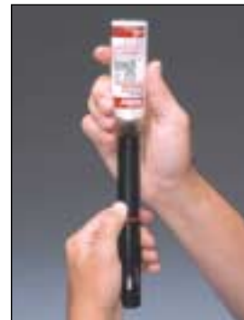
Refills in just 20 seconds with standard butane lighter fuel.