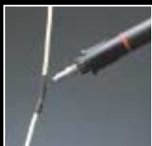
Hot air tip is perfect for heat-shrink applications.