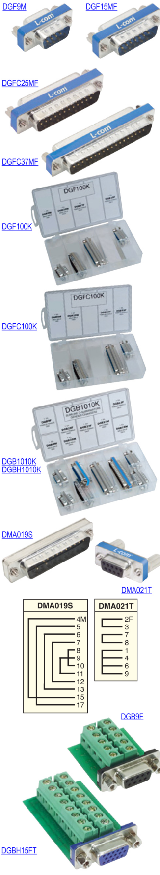
2008 Master Catalog 1.0