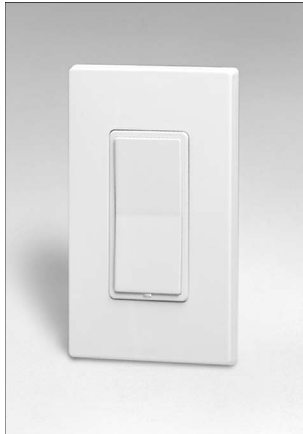
Cat. No. HCS10-1SW