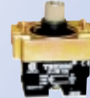
LED Pilot Light