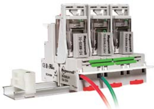
Coil Bus Jumpers colored green for better viewing.