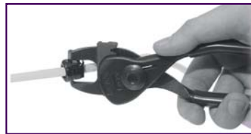
Part Nos. 0022 and 0030

Part No. 0T02 Conversion Kit provides the necessary components to convert a hand air tool to a bench mounted unit. The bench air tool can be mounted in any convenient position on the assembly area work surface. Unit is foot activated, leaving the operator's hands free.