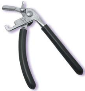
Part No. 0020