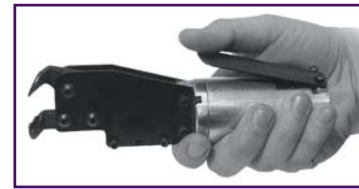
Hand Air Tool—HAT Series