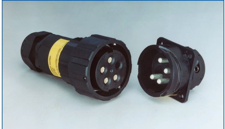
Amphe-GTR – 4 Conductor

Technical Specifications: Connectors are listed to UL/CUL 1977/1682/817 Standard, Control Number 19VP. The Amphe-GTR connectors utilize a standard PG adaptor watertight strain relief on the plug to achieve their IP67 seal rating. Size 4 RADSOK Contacts are individually rated to 120 Amperes continuous. Connector assemblies are current rated per the cross-reference table (back page). Insulation Resistance is rated at 1000 M \Omega and Dielectric Withstanding Voltage is rated at 2000 V AC (RMS). The Composite GT is flammability rated to UL94V-0.