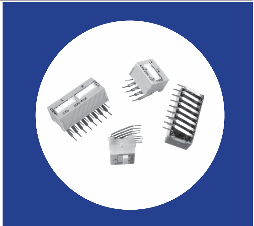
Series 206RA – Premium Gold Plated Contacts Series 208RA – Economical Tin Plated Contacts