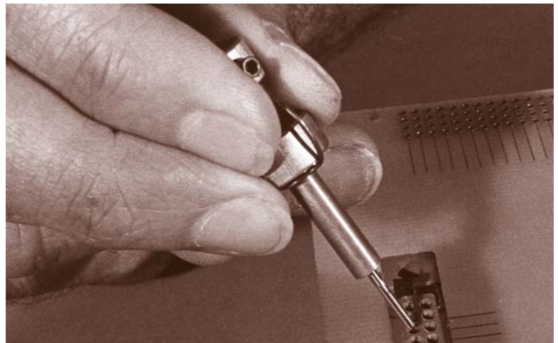
INSERT EXTRACTION TOOL WITH PLUNGER RETRACTED