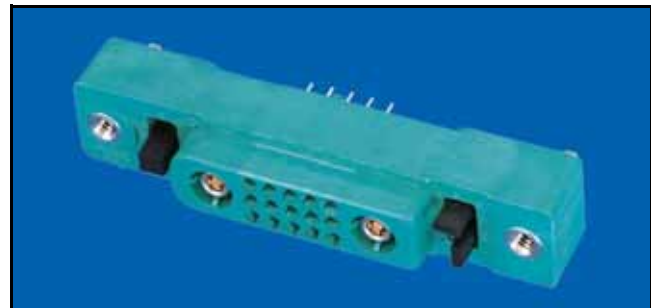
COMBINATION OF BRUSH CONTACTS AND SHIELDED CONTACTS