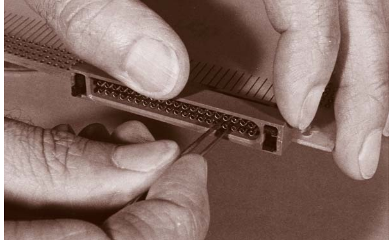
REMOVE DAMAGED CONTACT