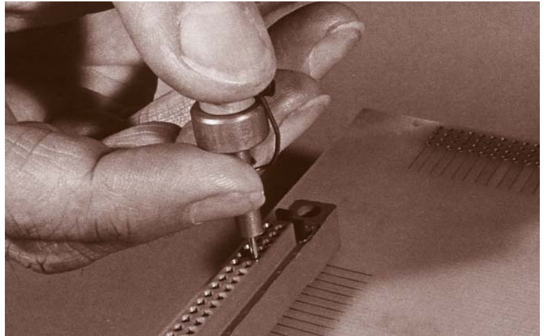
SEAT PLUNGER AND REMOVE CONTACT AND TOOL