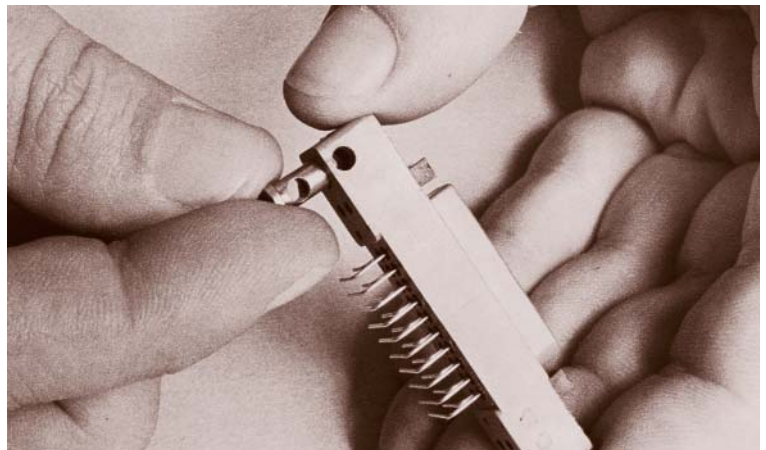
LOCKING BUSHING ACCESSORY INSERTED INTO PC CONNECTOR BODY