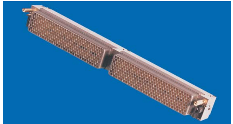
GEN-X GRID, 472 CONTACTS LRM PATTERN

Amphenol® LRM surface mount connectors are offered in configurations with up to 472 contacts in a SEM-E format and include ESD protection using the Faraday Cage principal. More contacts can be added to accommodate other formats. Other products available in the family are: