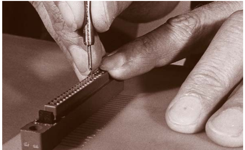
SEAT CONTACT WITH INSERTION TOOL