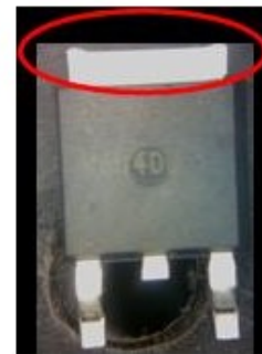
DPAK 4 rows Heat sink side is flat