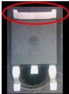
Current DPAK 3 rows Heat sink sides has protruding angles