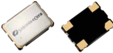
7.0 x 5.0mm Ceramic SMD