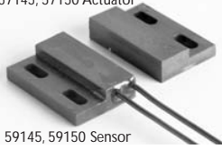
59145, 59150 Sensor