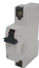
Add-on Neutral Pole