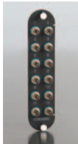
12-Fiber ST® Compatible Connector Panel | Photo LAN662