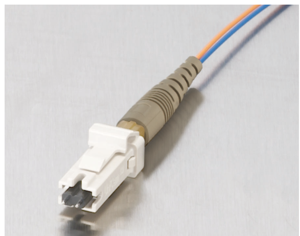
UniCam MT-RJ Multimode 62.5 µm Connector | LAN684