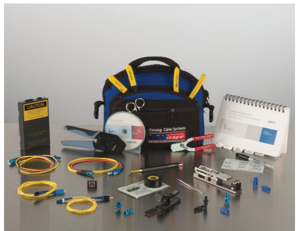
TKT-UNICAM-CTS Tool Kit | LAN695