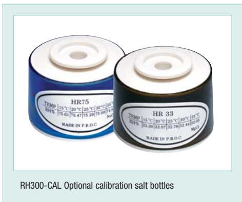
RH300-CAL Optional calibration salt bottles