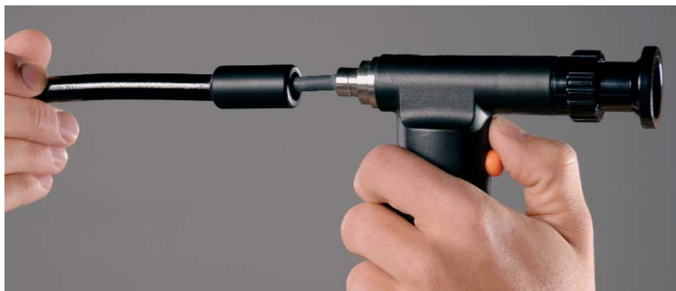
The different coverings are simply pushed on and pressed tight