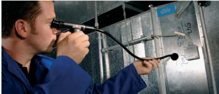
Checking in an air conditioning duct with gooseneck covering, medium flexibility.