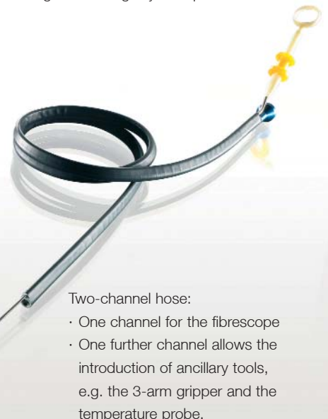
Two-channel hose: · One channel for the fibroscope · One further channel allows the introduction of ancillary tools, e.g. the 3-arm gripper and the temperature probe.