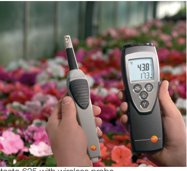
testo 625 with wireless probe