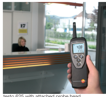
testo 625 with attached probe head