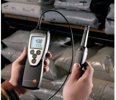
testo 625 with probe head attached by cable