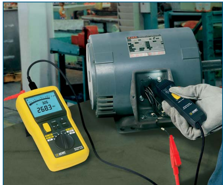
Remote probe used with Model 1045 to initiate a test at the motor. Target light provides good visibility of test area.