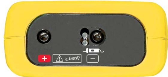
Models 1040 & 1045