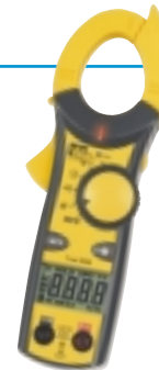
▶ 61-736 features: