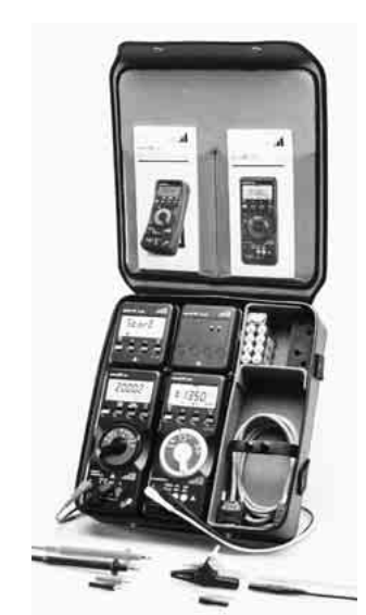
F840 (with sample contents)