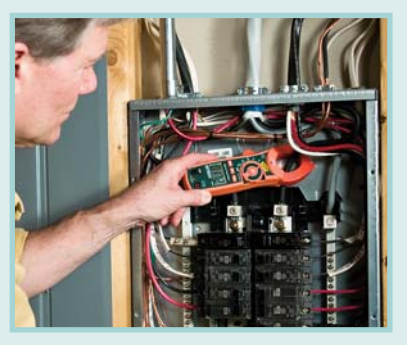
Compact size allows measurements in tight locations

Built-in non-contact Voltage detector with LED alert