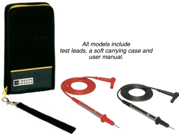
All models include test leads, a soft carrying case and user manual.