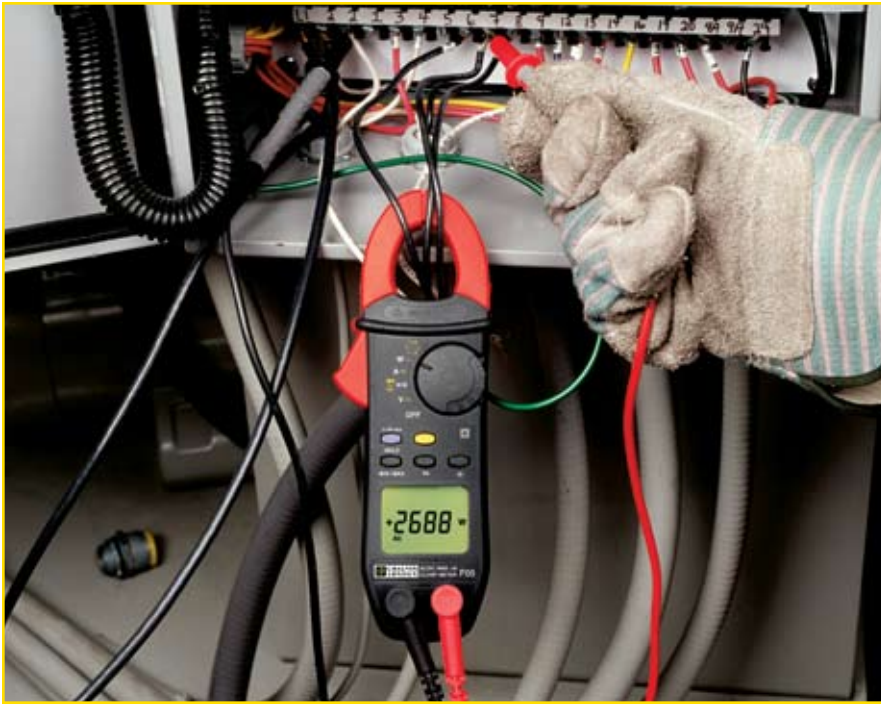
Model F05 monitoring volts, amps and watts on a control panel.

The F01 – F09 series of clamp-on meters is a high performance line of clamp-on meters built into a rugged compact sized case, with exceptional ergonomic design and extraordinary measurement possibilities. These are definitely not your generic off-the-shelf clamp-on! They are designed to offer professional measurement possibilities rarely seen in a clamp-on meter.