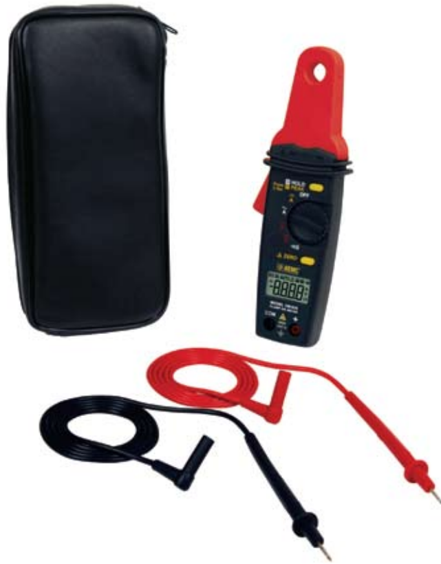
Model CM605 includes test leads, soft carrying case, 2 1.5V AAA and user manual.