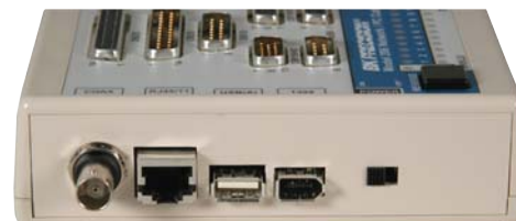
USB A/B & 1394 Fire wire Interface