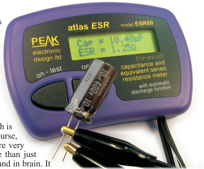
Test Lead Length: typically 45cm (18")

Traditionally, ESR can be a tricky thing to measure, which is a shame, it's a very useful diagnostic parameter. Of course, ESR meters are available from various sources, some are very famous in the repair sector, but the Atlas ESR is more than just another ESR meter. For a start, it's smart, both in looks and in brain. It can measure and compensate for the effects of measuring in-circuit, it also knows that you don't want to be hassled with capacitor polarity.