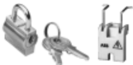
Padlock + 2 keys + lock adapter