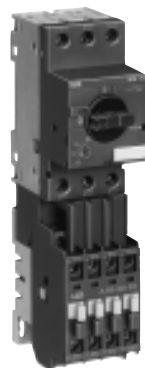
MS 116 with A-contactor