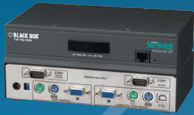
ACR2004A: top: front view; bottom: rear view