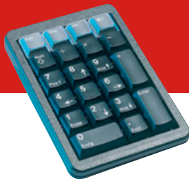
G84-4700 PRB (1)