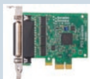
PX-260: LP PCIe 4xRS232 1MBaud