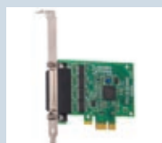
PX-701: PCIe 4xRS232 (4x9 pin cable)