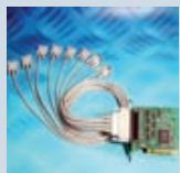
UC-279: uPCI 8xRS232