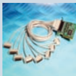
UC-275 uPCI 8xRS232 DB25