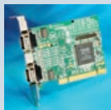
UC-257: uPCI 2xRS232