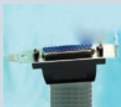
CC-032 LPT Adapter Cable

For higher baud rates see UC-302 & UC-607