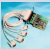
UC-268: uPCI 4xRS232