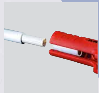
Stripping of round cables between 8.0 - 13.0 mm dia.