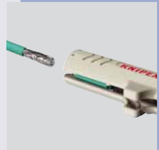
Stripping of UTP/STP data cables between 5.0 - 15.0 mm dia.