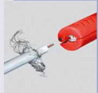
Stripping the conductor of a Coax-cable