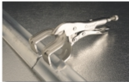
Locking Welding Clamp holds workpieces firmly in position. Open design allows clear access for welding.