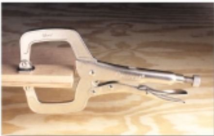
Locking C-Clamps allow quick, easy positioning of workpieces. Swivel tips minimize marring on softer materials.

Crescent brand locking pliers are made to an exacting standard that results in improved durability and long-term performance. In fact, they not only meet the performance of the leading competitor, but also meet stringent ASME standards B107.24 and B107.36, as applicable, for product specifications, including strength and maximum jaw opening capacity. Yet, as strong as they are, Crescent locking pliers still maintain the narrow profile required for work in tight and confined spaces. A full line of locking products is available, including curved and straight jaw pliers, long nose pliers, regular tip and swivel-pad 'C' clamps, cushion grip sets, and more. See the new line of Crescent locking pliers soon wherever true professional quality construction tools are sold.