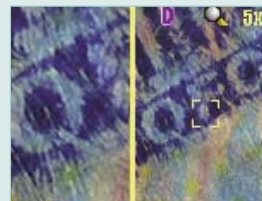
Dual Window view simultaneously displays magnified image next to the original image