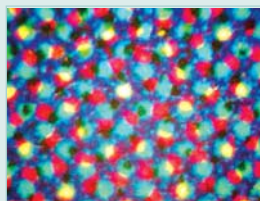
Analysis of printing