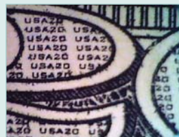
Check for counterfeit money