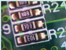
PC board inspection