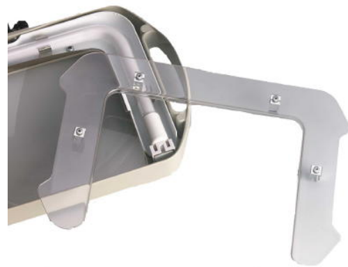
13226 Bulb Shield for Vision-Lite®

O.C. White Co. 4226 Church St. Thorndike, MA 01079