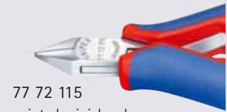
77 72 115 pointed mini-head, with small bevel