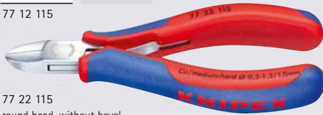
77 22 115 round head, without bevel