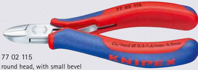
77 02 115 round head, with small bevel