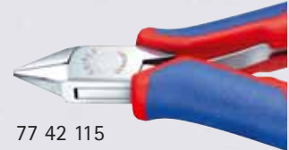
77 42 115 pointed head, without bevel