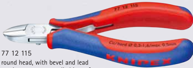
77 12 115 round head, with bevel and lead catcher - no uncontrolled loss of cut wire ends