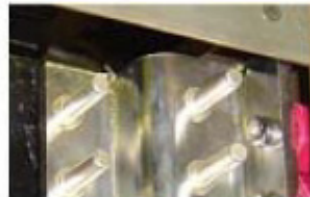
Chassis showing application of Plastic SurLok™

Notice: Specifications are subject to change without notice. Contact your nearest Amphenol Corporation Sales Office for the latest specifications. All statements, information and data given herein are believed to be accurate and reliable but are presented without guarantee, warranty, or responsibility of any kind, expressed or implied. Statements or suggestions concerning possible use of our products are made without representation or warranty that any such use is free of patent infringement and are not recommendations to infringe any patent. The user should assume that all safety measures are indicated or that other measures may not be required. Specifications are typical and may not apply to all connectors.