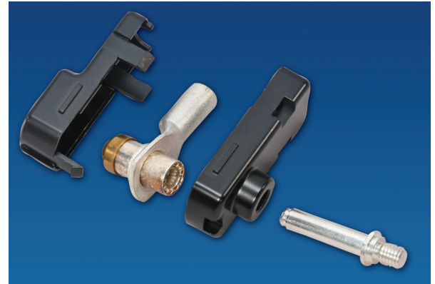
SurLok™ with Plastic Housing

For more information: Amphenol Industrial Operations Phone: 607-563-5011 Web: www.amphenol-industrial.com