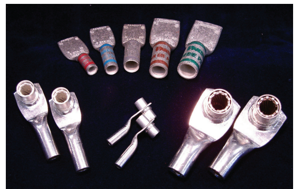
Industry Standard Color Coding