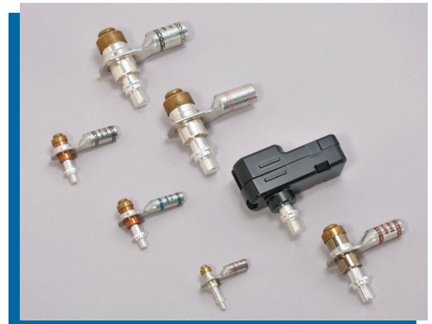
4 Sizes, 7 Ampacities (see table on back)