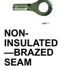
NON-INSULATED —BRAZED SEAM